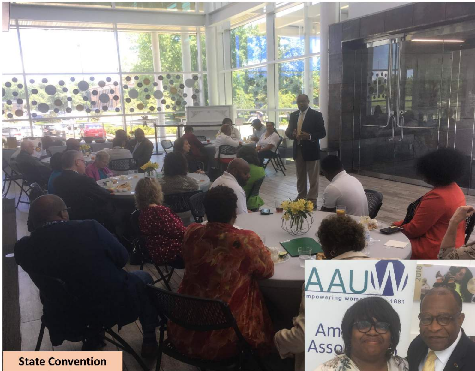
State Convention Scrapbook 2019, Grammy Museum, Mississippi