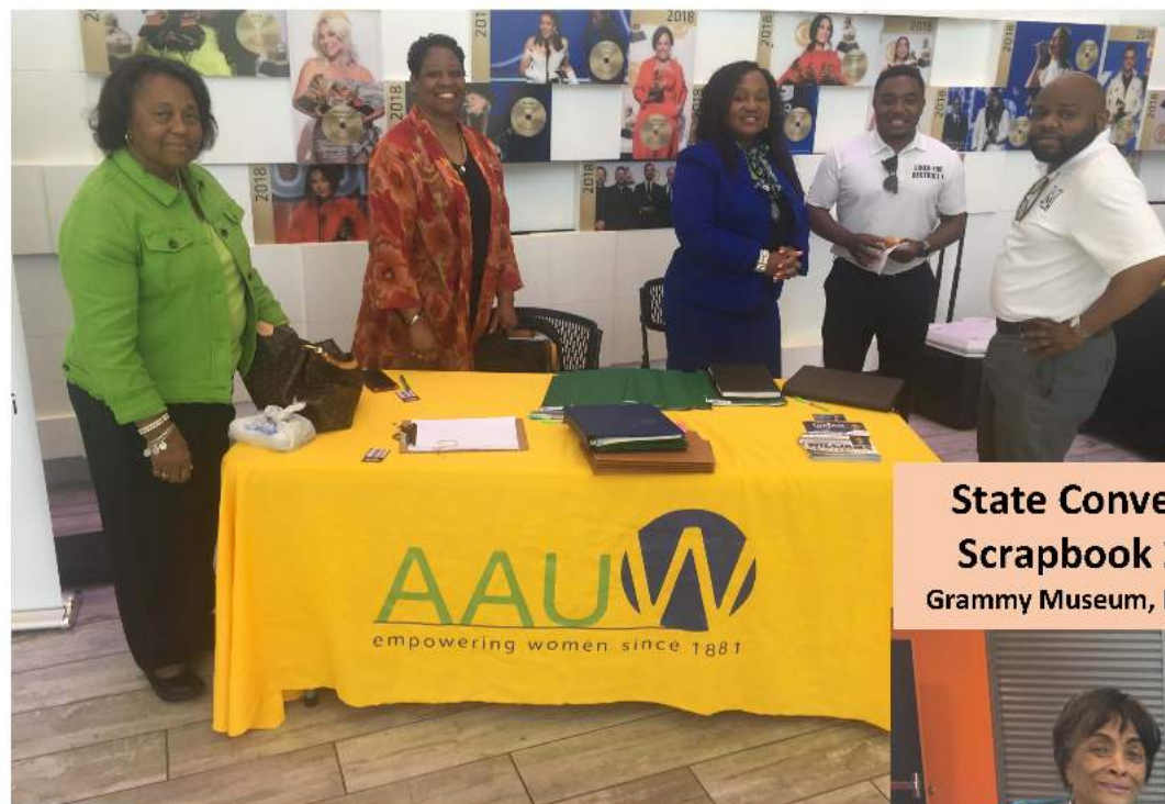
State Convention Scrapbook 2019, Grammy Museum, Mississippi